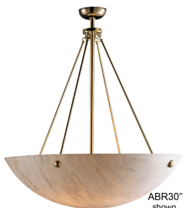
ABR30 + shown