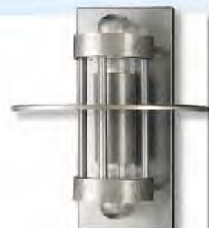
HL317 18" W, 21" H, 12-3/4" E, 10-1/2" Mtg.Ctr.

Note: Optional rain deflector required on upper diffuser for outdoor applications. Please add suffix " RD " to catalog number to order.