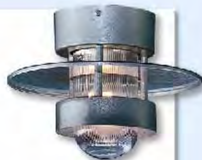
HL333 10" Dia, 7-1/2" H

Please ADD desired Diffuser, Finish and Light Source codes to catalog number when ordering. Example: HL333 CPR FS (Incandescent - no Light Source code required)