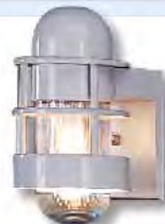
HL335 5-1/4" W, 10" H, 7" E, 6-1/4" Mtg.Ctr.

Please ADD desired Diffuser, Finish and Light Source codes to catalog number when ordering. Example: HL335 CPR WH -22Q