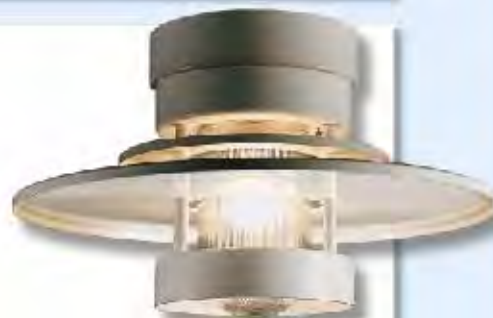
HL333XL 18" Dia, 11-1/4" H

Please ADD desired Diffuser, Finish and Light Source codes to catalog number when ordering. Example: HL333XL SE WH -M50/R